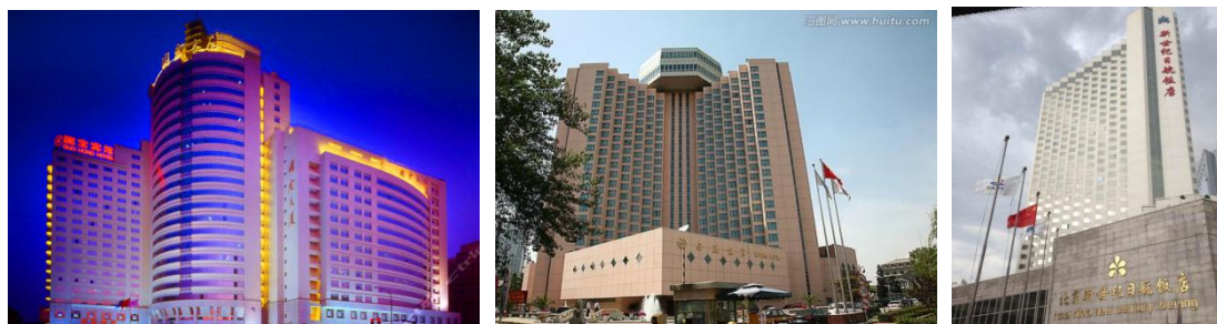
Other hotels near the congress venue: Guohong Hotel, Hotel Nikko New Century, Xiyuan Hotel

3) Xiyuan Hotel: Five-star garden business hotel, about 2.5 Km north of CHST; address: No.1 Sanlihe Road, Haidian District, Beijing. Tel: 010-51655520; http://www.xiyuanhotels.com/