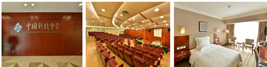
Hotel rooms at the China Hall of Science and Technology in Beijing

If you need to reserve the hotel in CHST, please contact APC2019 Secretary by email: pse@nigpas.ac.cn .